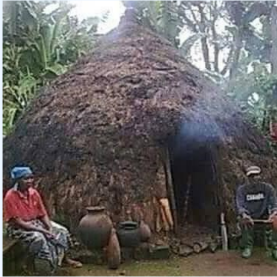
Left: A traditional house in Moshi.