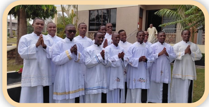
Above: 2nd Year Theology Seminarians gather following the Lector Assignments at Segerea Senior Seminary. All are sponsored!!