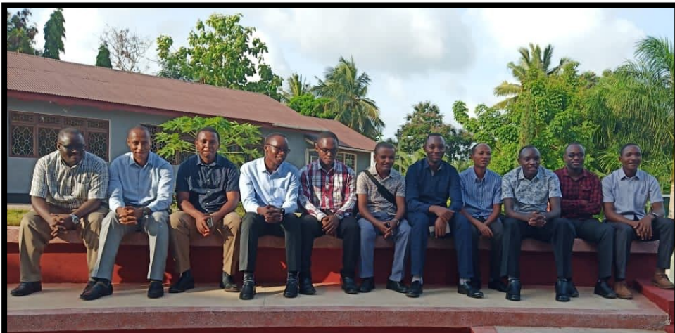
Below: 4th Year Theology Seminarians at Segerea—Happy to participate in the diaconate ordination at Archdiocese of Dar es Salaam on 8th January, 2022.