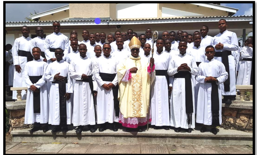
Segerea Seminary poses for a picture with Archbishop Jude Thadeus Rwaich of the Archdiocese of Dar es Salaam following Holy Mass.