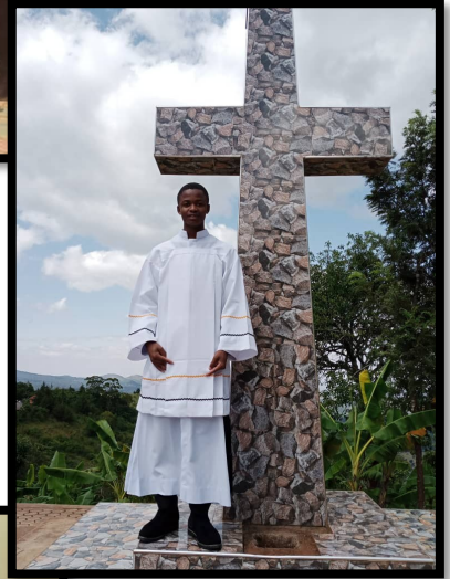
Right: here is the place where the first small Christian Community was established in The Catholic Diocese of Moshi, and it is in Legho Parish where i had an opportunity of visiting the place during my pastoral experience at Karanga Parish.