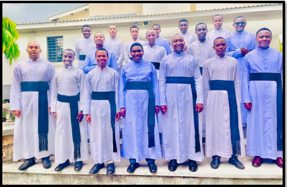
Above: Gaudete (Joyful) Sunday with 17 Moshi seminarians in Segerea Senior Seminary!

We wish everyone the best Christmas celebration.