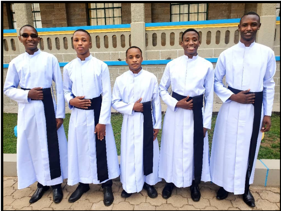
Above: Praise be Jesus Christ. Kibosho Senior Seminary 1st Year Philosophy Fraters from the Catholic Diocese of Moshi received their cassocks on 30th November. Congratulations Fraters!! You look very smart in your cassocks.

Kibosho (Our Lady of Angels) Senior Seminary is located in the Catholic Diocese of Moshi and is a Philosophicum. Of the 137 seminarians of the Moshi Diocese, 10 are at Kibosho Seminary.