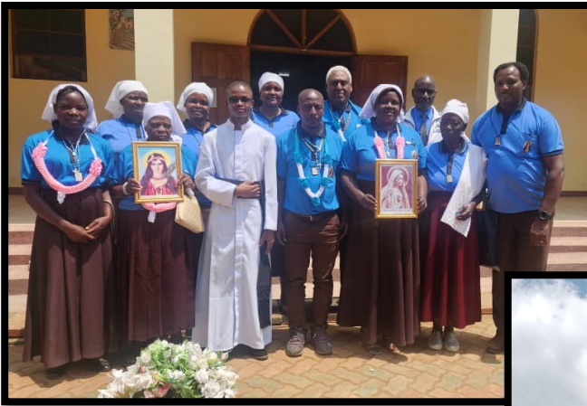
Left: New members of the living rosary on their feast that was on August 25th this year – at Karanga parish